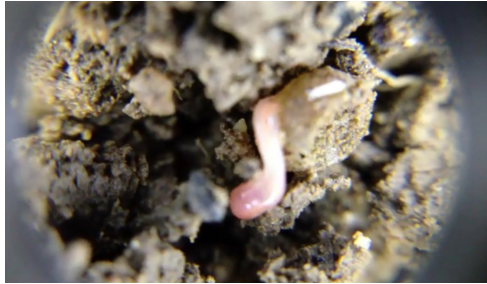
Worm emerging from egg within the pore space of a well-aggregated soil.

Increasing the time that there are living roots in the soil achieves the first three principles, and can be accomplished through crop rotations, inclusion of cover crops, and/or through dedicated grasslands (native or pasture). Mixing up which plants are grown during the year or over the course of multiple years may help to break disease/pest cycles. Maximizing biodiversity and living roots helps to stimulate belowground biological activity and increase biodiversity belowground as well as increase predator and pollinator populations aboveground. When these two principles are properly applied, soils not only maintain SOM but can build SOM and enhance nutrient cycling and overall plant growth (crop or forage).