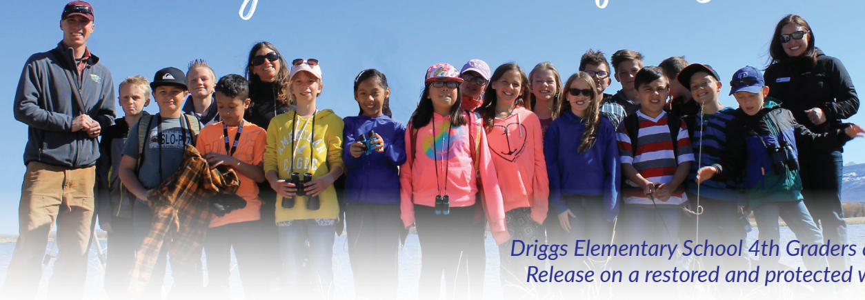
Driggs Elementary School 4th Graders at a Swan Release on a restored and protected wetland.

The inspiration for the Teton Regional Land Trust came from a small group of community members who recognized this cherished landscape with its unique agricultural character and vibrant wildlife populations was at risk.