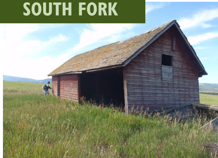
Winterfeld Farm - protected 2014